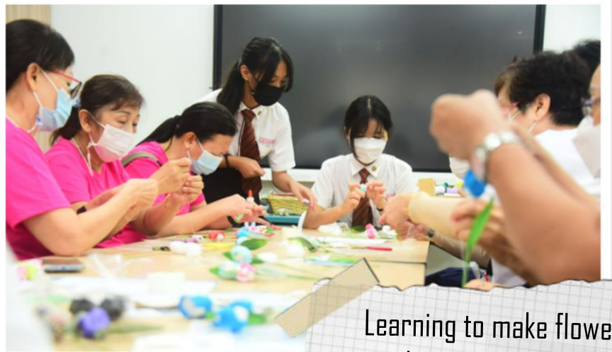
Learning to make flowers with recycled materials