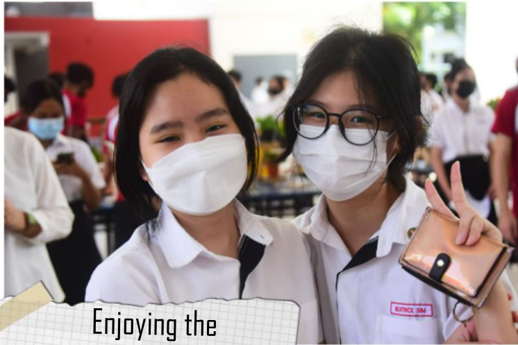
Enjoying the SPARCLE 2 showcase