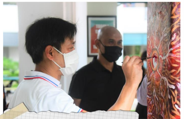
Adding the finishing touch... Artmosphere opening