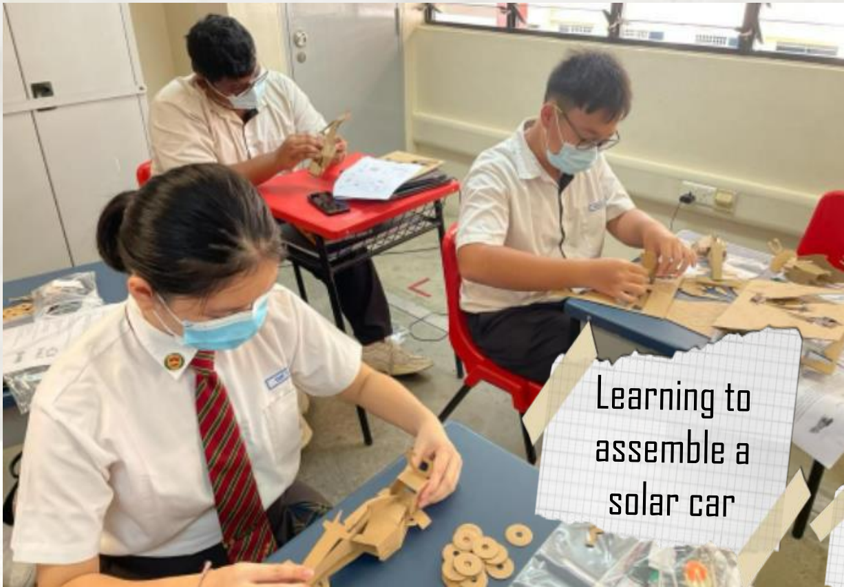
Learning to assemble a solar car