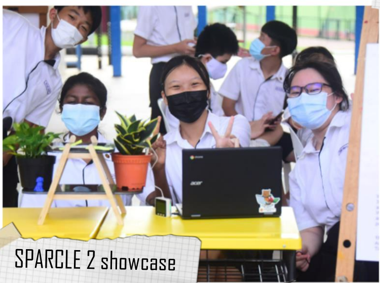
SPARCLE 2 showcase presenters