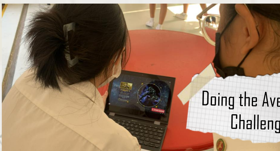
Doing the Avengers Challenge