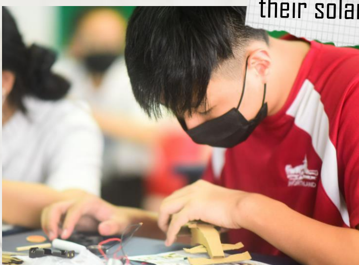
Assembling their solar cars