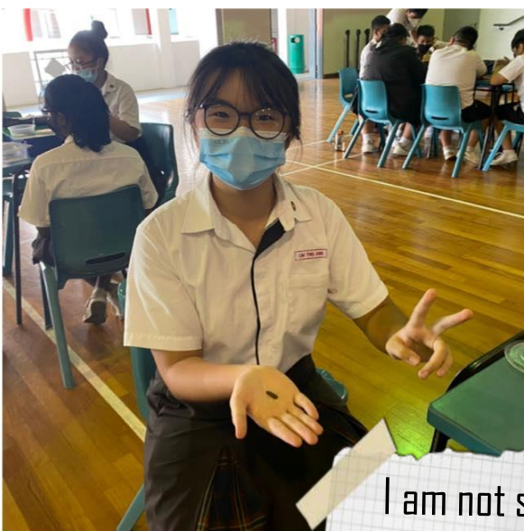
I am not scared of creepy crawlies