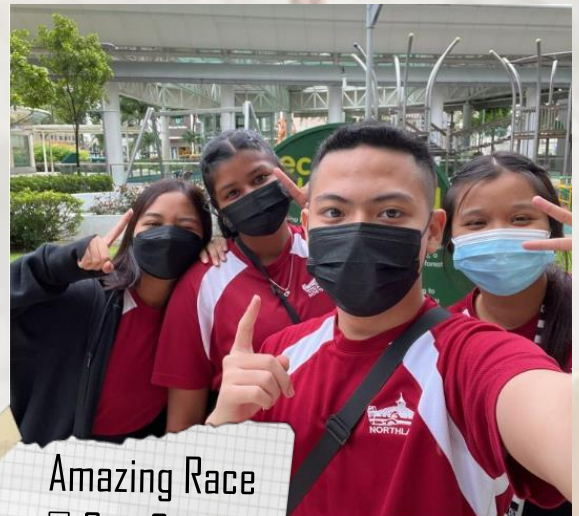
Amazing Race @ City Square Mall