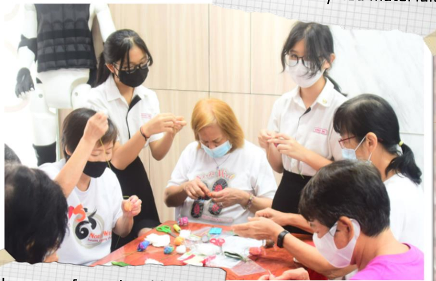
Learning from the elderly