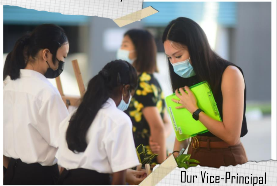
Our Vice-Principal looking at the group's presentation