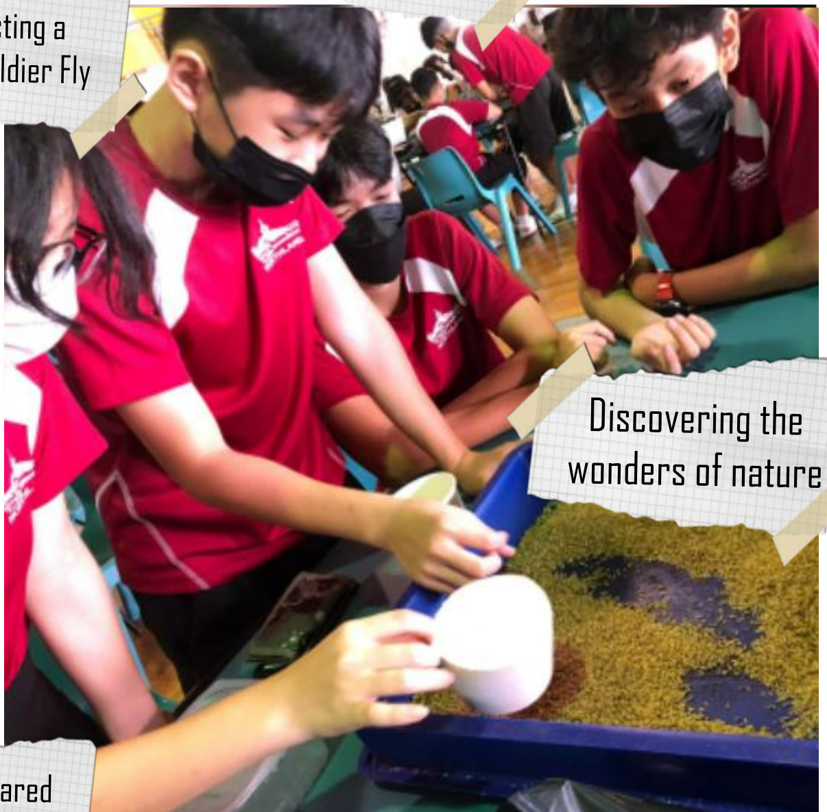
Discovering the wonders of nature