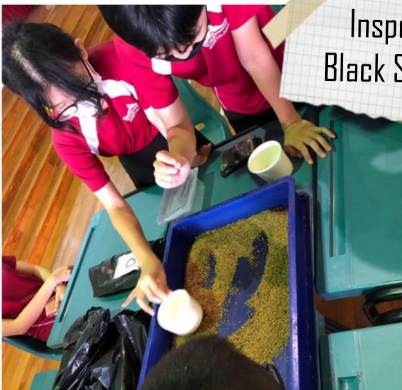
Inspecting a Black Soldier Fly