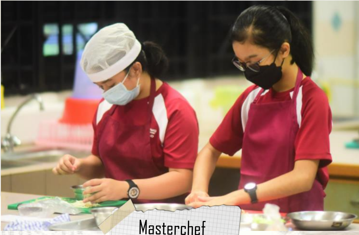
Masterchef Cook Off