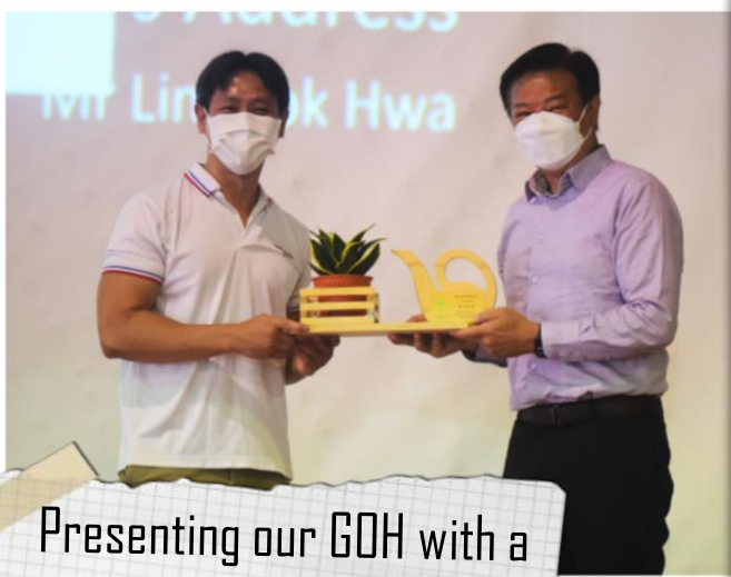
Presenting our GOH with a token of appreciation